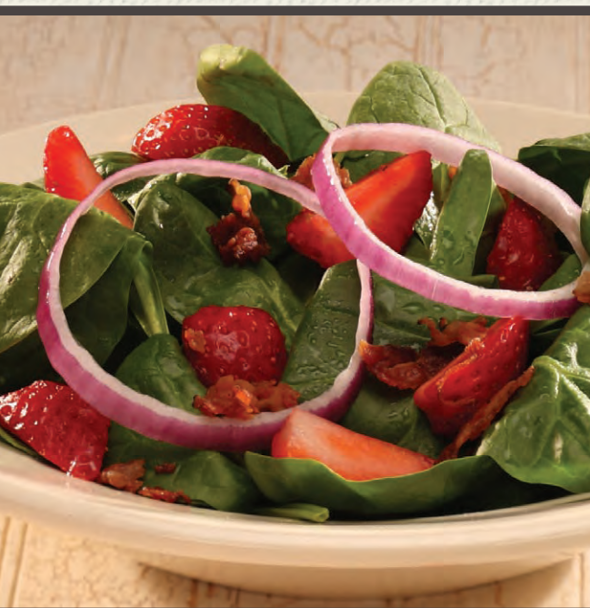
Spinach Side Salad