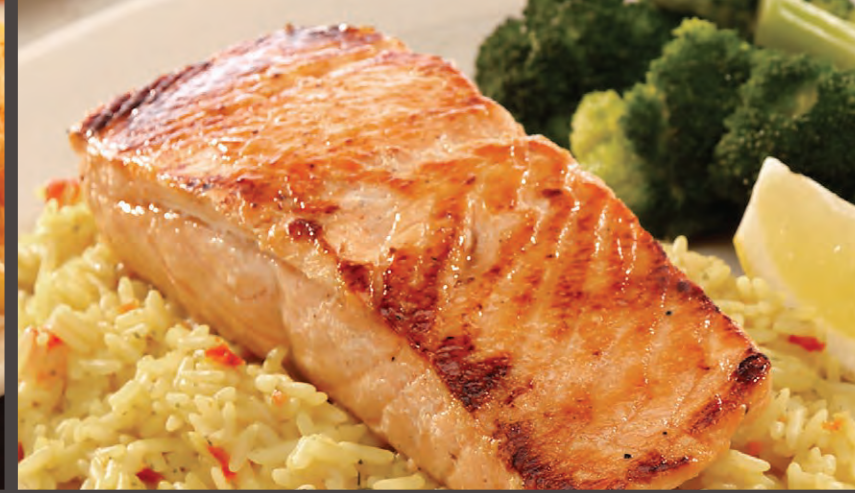
Sweetwater Bourbon Salmon