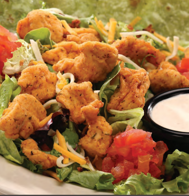
Sagebrush Signature Salad