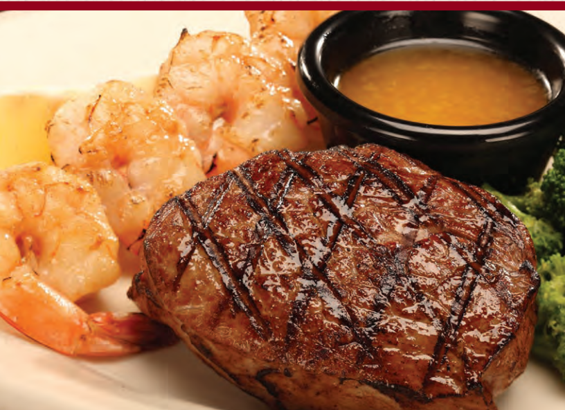
Sirloin and Shrimp