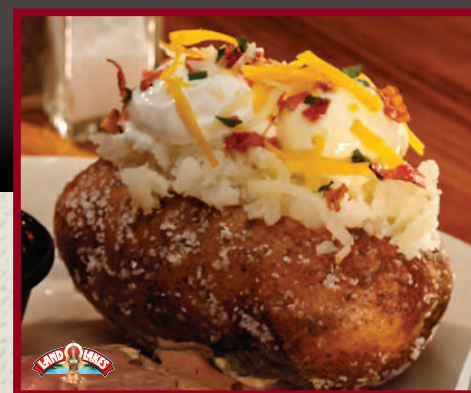
Loaded Idaho Baked Potato

★Load them with Cheese, Bacon and Chives....99¢