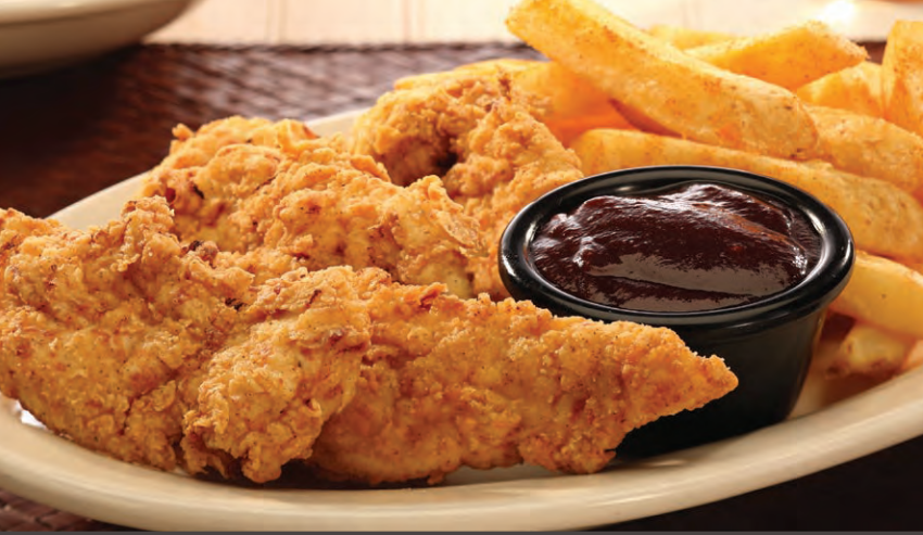
Hand-Breaded Chicken Tenders