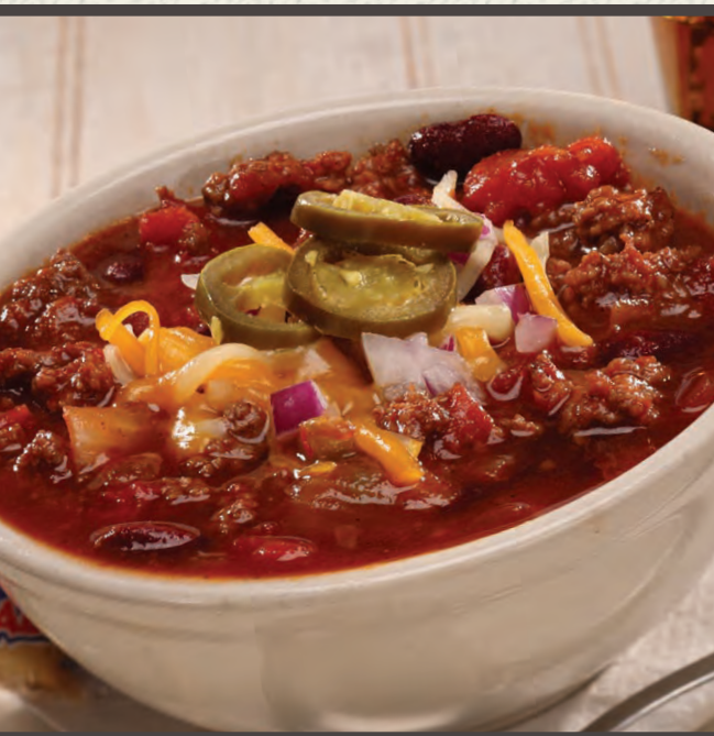
Award Winning Chili